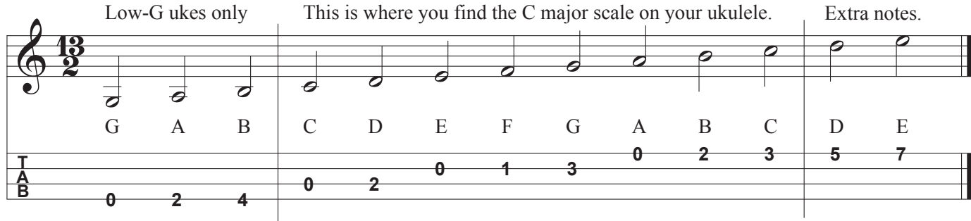
Playing the C Scale: Learn effective techniques for each hand.

For now, use only your thumb on your right hand. On your left hand use: